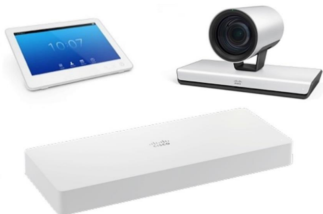
Figure 1. Cisco Webex Room Kit Plus Precision 60 integrator package

The Room Kit Plus P60 integrator package is rich in functionality and experience but is priced and designed to be easily scalable to all of your collaboration spaces – whether registered on the premises or to Cisco Webex in the cloud.